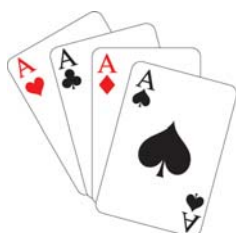
Board 9. Dealer North. E/W Vul.

In the Closed Room, South led the \heartsuit 10. This might not say anything about his hand or it might say a lot. On auctions like this, leading a spade is common so, as South didn't lead one, declarer decided that his spade holding might have prevented him from doing so and therefore finessed him for the \spadesuit Q.