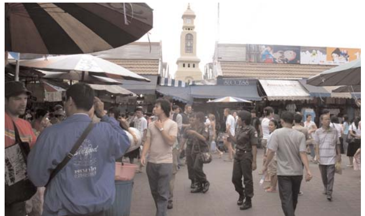
A View of Jatujak Weekend Market

throughout and coasted to a 187-89 IMP win with a set to spare. In the final Israel will meet Latvia, who hung on to win a desperately tight match by a single IMP, 135-134, and make it double heartache for Poland. Israel will have a 2 IMP carry-over advantage in the final. Whatever the outcome of that match, we can already congratulate Latvia on a first bridge World Championship medal at any level. In the bronze medal play-off, Poland will start with a 5.33 IMP carry-over advantage against Australia.