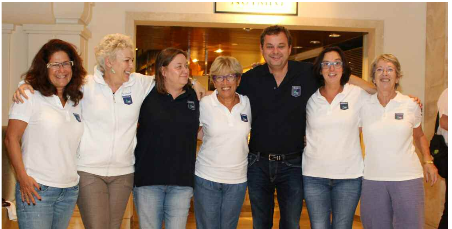
The French ladies with their captain.