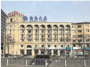
Hainan Hotel 4 Stars

(Headquarter hotel, 2 minutes to the venue by walking)