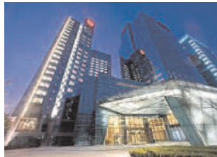
Sheraton Beijing Dong Cheng Hotel 5 Stars

(Headquarter hotel, 2 minutes to the venue by walking)