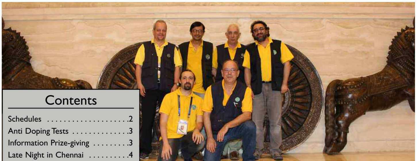
The WBF Scoring Team