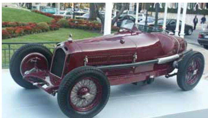
This race car and others can be seen outside the Casino

It's not how you start but how you finish, and competitors in the three main events - Bermuda Bowl, Venice Cup and Senior Bowl - got down to business yesterday, all with the goal of having their figurative engines running at their best when the round-robin phase of the tournament runs its course Saturday night.